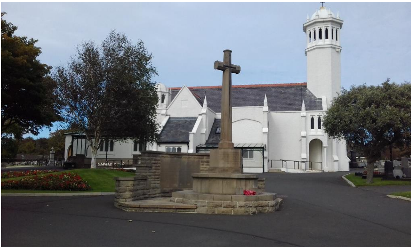
Cross of Sacrifice